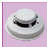
(140mm dia x 53mm)